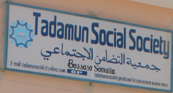
This is Tadamun Head Quater office in Bosaso, Bari Region