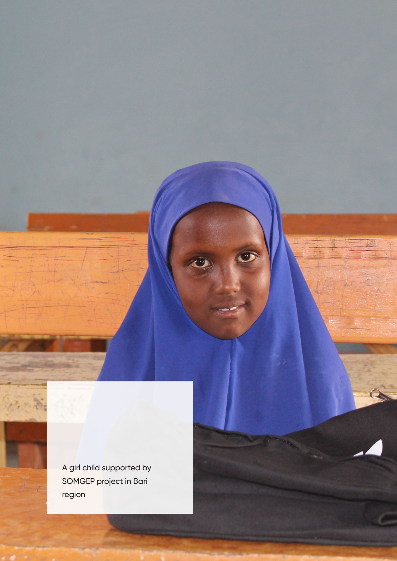
A girl child supported by SOMGEP project in Bari region