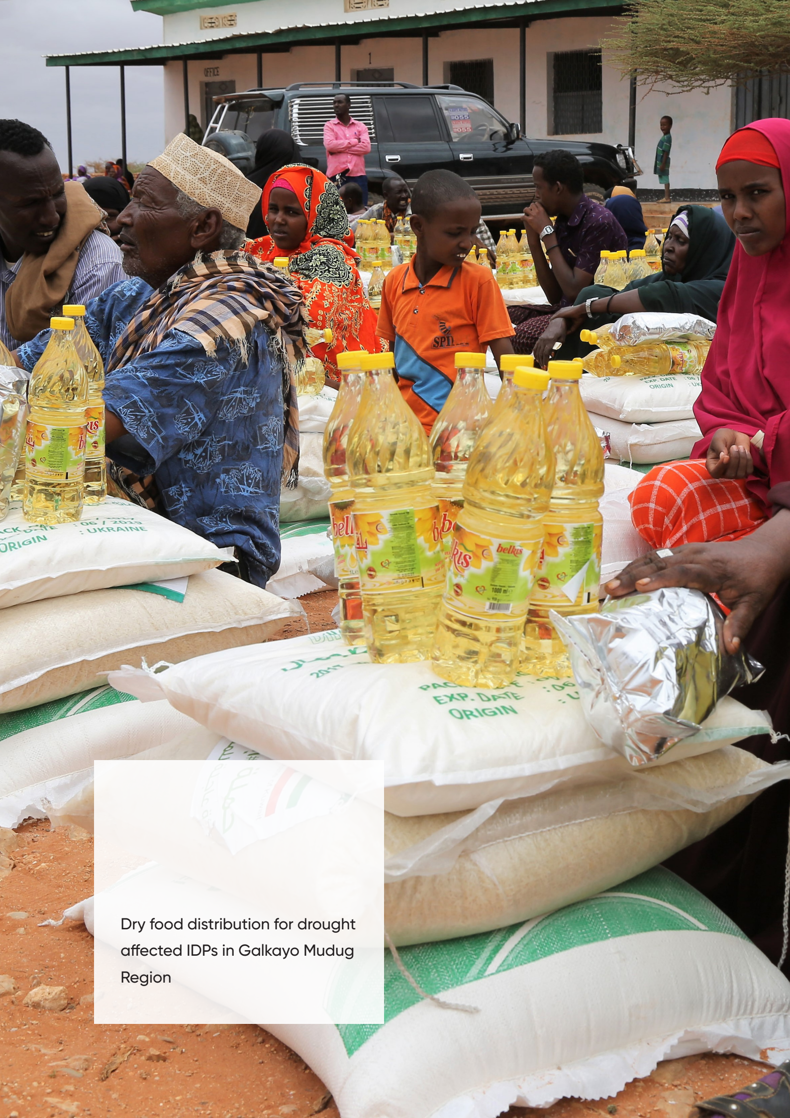
Dry food distribution for drought affected IDPs in Galkayo Mudug Region