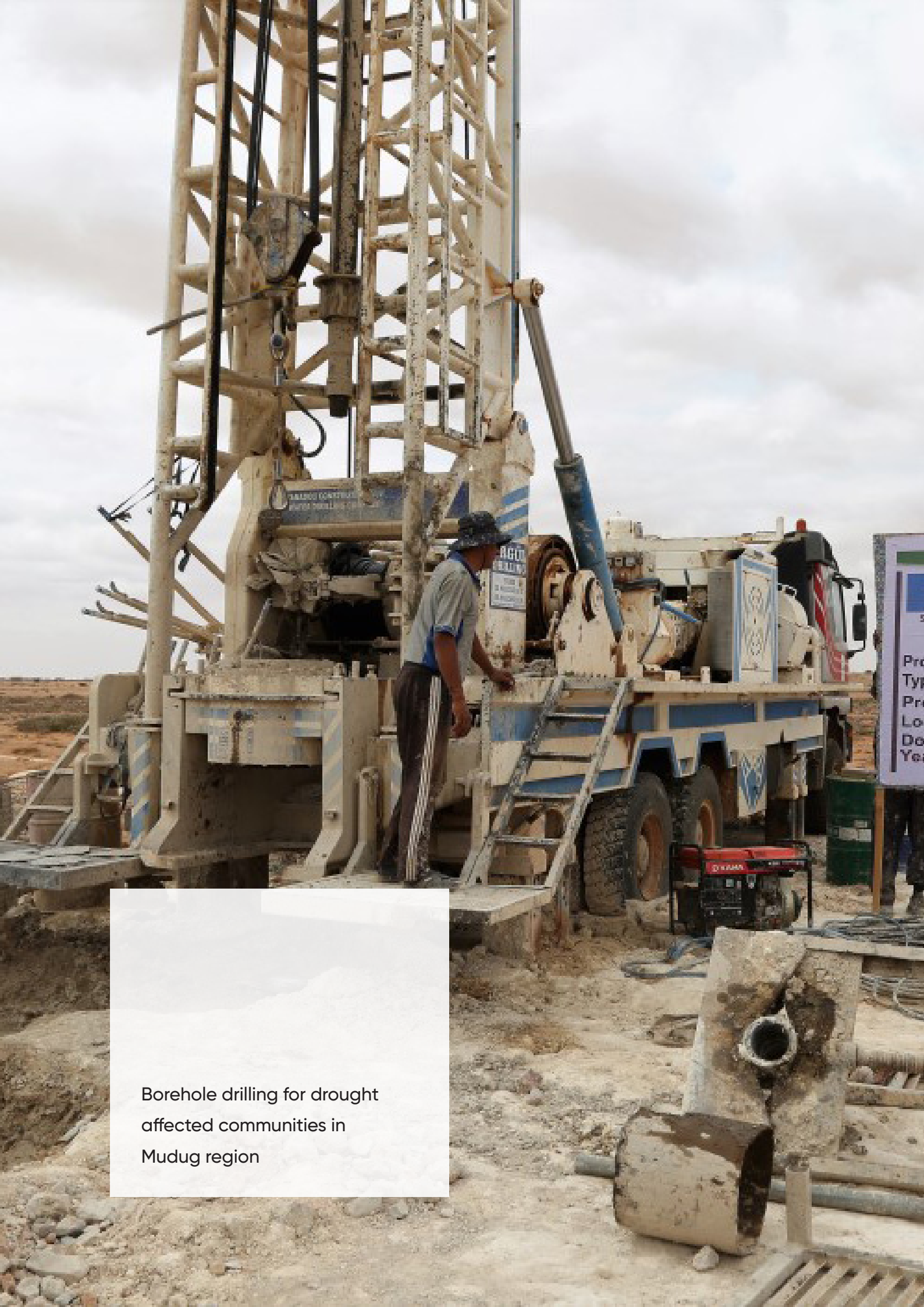
Borehole drilling for drought affected communities in Mudug region